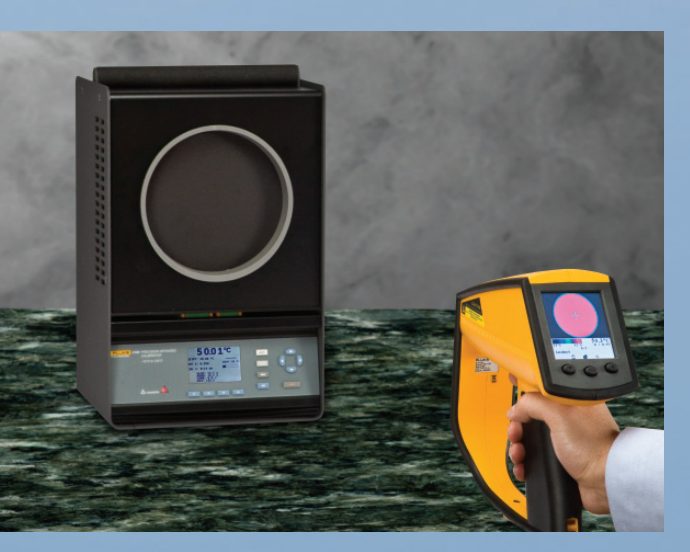
Calibrate it right the first time with a traceable, uniform, correctly-sized target.

Business decisions costing thousands of dollars are based on the results of your measurements, so they had better be right! It can be very expensive to shut down a line for repairs and maintenance, but it might be catastrophic if the shutdown is unplanned. To stand by your measurements with confidence, you should definitely have your thermometers calibrated.