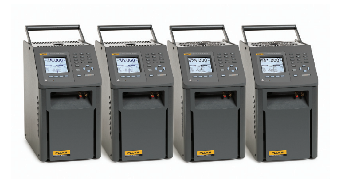
The Metrology Well family consist of four models (Model 9170, 9171, 9172, amd 9173) which, combined, cover a temperature range of -45 ^{\circ} C to 700 ^{\circ} C.